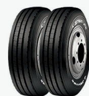
7.5 R16 -16PR Tyres for better tyre life and mileage