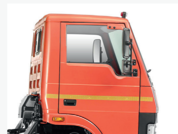
Cabin Safety - safer all steel cabin with stronger build quality for better safety to the Driver