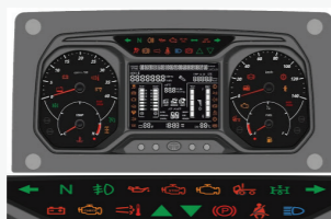
New Multifunction Instrument Cluster Features: Average Fuel Economy, Digital DEF indicator, Gear Shift Advisor, Regeneration Indicator Tell Tale Symbols