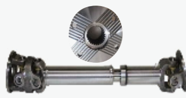
Serrated Coupling flange propeller shaft for better Reliability, Maintenance & to improve Power Transmission