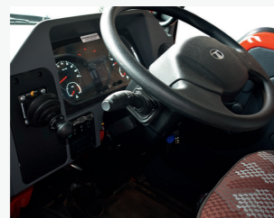
Tilt and telescopic Power Steering- Adjustable to any driver with respect to his height