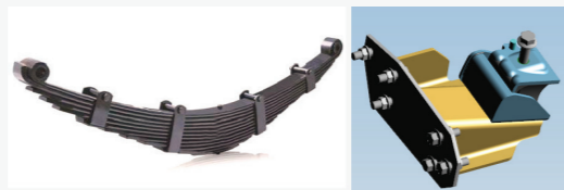
Semi Elliptical Leaf Spring Suspension lower, cabin NVH with improved engine mount for enhanced cabin comfort