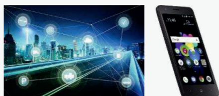
Advanced Fleet Edge Telematics system - Fleet Manager mobile app, Fleet owner app, Driver app