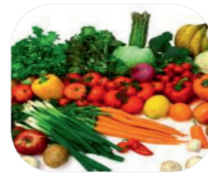
Fruits and Vegetables