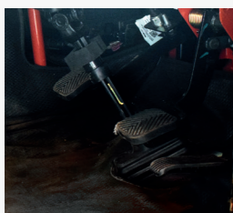
ABC Pedals: Improved Ergonomic pedal positions to reduce fatigue