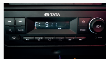
Music system & blaupunkt speakers + USB fast charging