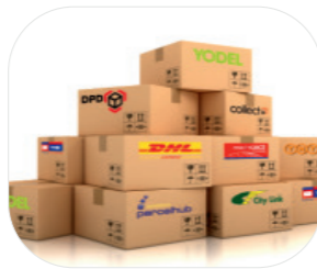
Parcel and Courier/ E Commerce