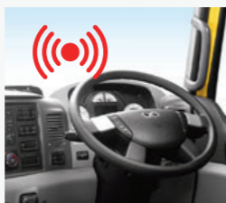
Reverse parking assistance