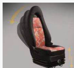
All weather proof Melba fabric seat with features like reclining, Sliding, and Height adjustable as per weight for best in class driving comfort