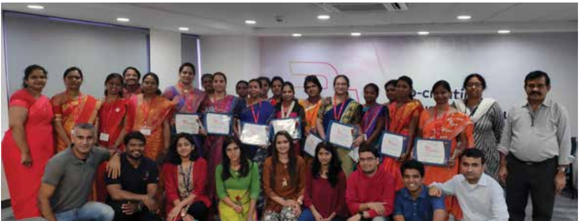
Amdocs employees with the first batch of Revolving Grant beneficiaries.

This revolving grant has helped this group to believe in themselves, begin their journeys towards self - reliance, and launched their careers, forever changed, as successful entrepreneurs.