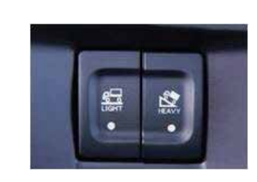
2 Mode Fuel Economy Switch LIGHT & HEAVY MODE