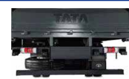
Reverse Parking Assistance System