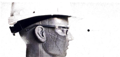
Impact Resistance Test